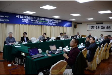
Photos: IEA EBC Annex 62 – Ventilative Cooling – 3 rd Expert Meeting, Changsha, China