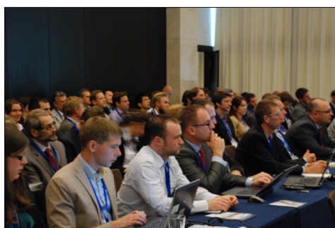
Photo: 35 th AIVC – 2 nd venticool – 4 th TightVent joint Conference in Poznań, Poland September 24-25, 2014

The paper available at http://venticool.eu/wp-content/uploads/2014/12/AIVC2014_Ventilative-Cooling-Track_Summary.pdf gives an overview of the trends and conclusions based on the presentations and discussions in the ventilative cooling track of the conference.