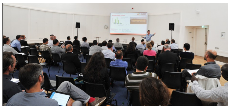
Photo: IEA-EBC Annex 62 2 nd Expert meeting, 16 September, 2014 Uxbridge, UK