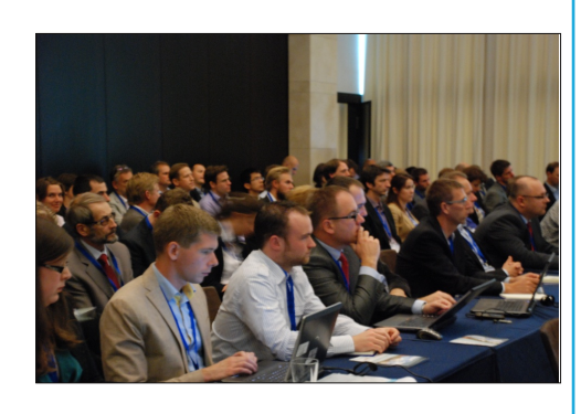
Photo: 35<sup>th</sup> AIVC – 2<sup>nd</sup> venticool – 4<sup>th</sup> TightVent joint Conference in Poznań, Poland September 24-25, 2014