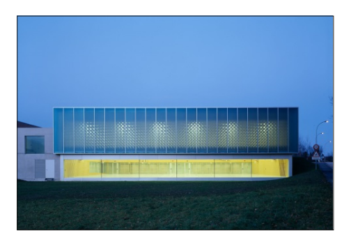
Figure 2: A dual sports hall in Nyon, Switzerland (presented by Flourentzou et al.*). Graeme Mann & Patricia Capua Mann Architects, 2011.

A discussion on personal control over indoor climate and the use of operable openings showed that operable openings