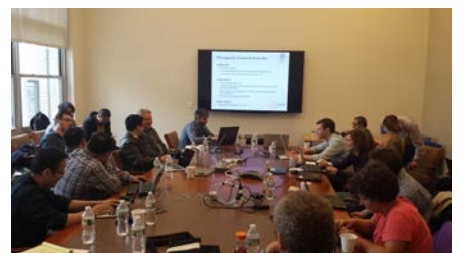
Photos: IEA EBC Annex 62 – Ventilative Cooling – 4th Expert Meeting, 12-13 October 2015, Boston, USA