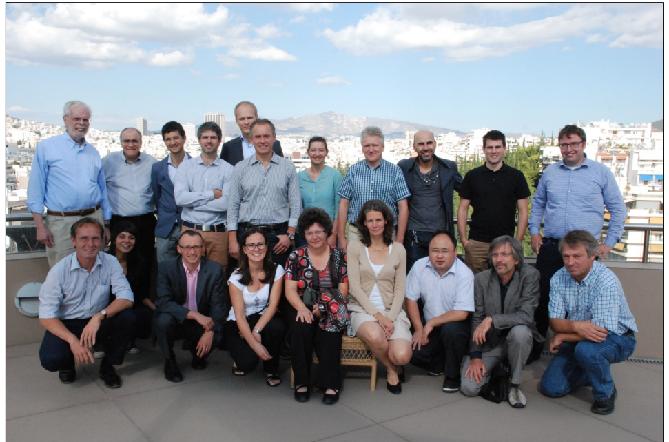
Figure 1: 2 nd Annex 62 preparation meeting, Athens, Greece, September 23-24, 2013.