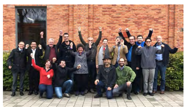
Happy participants after completion of the last meeting of Annex 62 meeting at KU Leuven, Gent, Belgium

The meeting also included a discussion of recommendations for standards, legislation and compliance tool to improve the application of ventilative cooling in new and existing buildings in the future. These recommendations are based on a thorough analysis of international standards in the field and of the present legislation as well as the compliance tools used in 8 European countries. The full background report as well as a short summary with recommendations will also be available in the beginning of 2018.